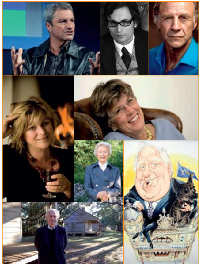
LITERARY FESTIVAL (CLOCKWISE FROM TOP LEFT): GAVIN ESLER, SIMON VAN BOOY, RANULPH FIENNES, PRU LEITH, ROY HATTERSLEY, DAN CRUICKSHANK, SARAH RAVEN, THE DOWAGER DUCHESS OF DEVONSHIRE